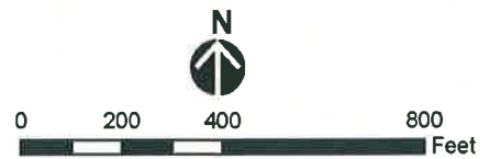
Figure 6. Lakeside Land Use for Lake Geneva, King County, Washington.